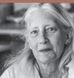
Getting it right this time . . . page 3