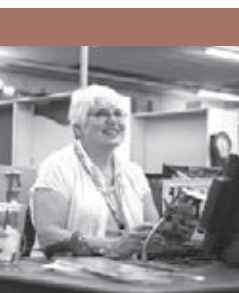
Volunteers page 4